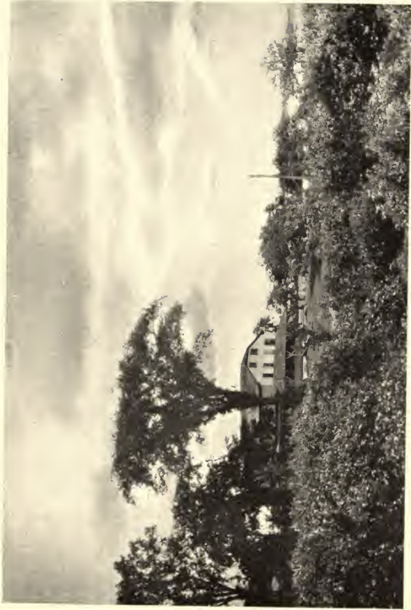
SITE OF SMITH'S LANDING AND GARRISON HOUSE Wickford, Rhode Island. The present structure, erected immediately after the destruction of the garrison in King Philip's War, is said to contain some of the timbers of the original house